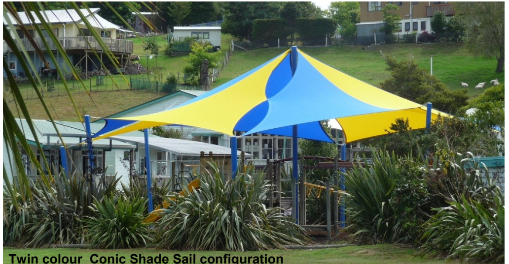
Twin colour Conic Shade Sail configuration