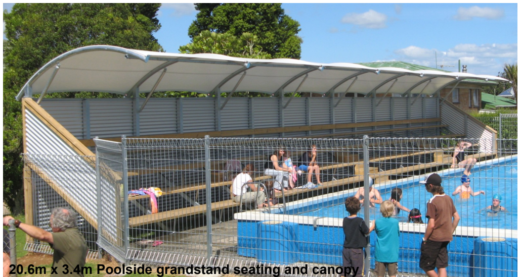
20.6m x 3.4m Poolside grandstand seating and canopy

Structure Description: Tiered seating incorporated with a curved membrane canopy.